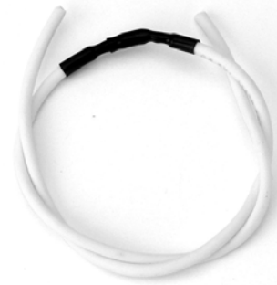
TPS Resistor Wire